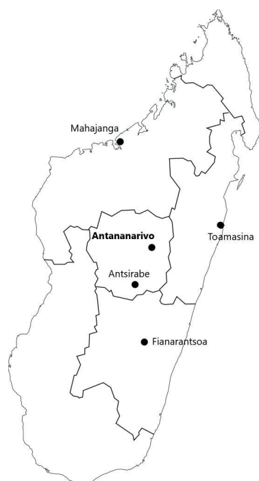
Fig. 2. Location of rehabilitation centres in Madagascar included in the evaluation (17).

Sixty semi-structured interviews were carried out (Table III) in Madagascar. Eight focus groups were also conducted; the 50 participants included rehabilitation doctors, physiotherapists and prosthetic/orthotic technicians from 6 rehabilitation centres (Fig. 2).