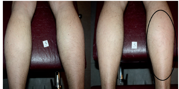
Fig. 2. Rubor elicited in a typical instrument-assisted soft-tissue mobilization (IASTM) intervention volunteer (area circled).