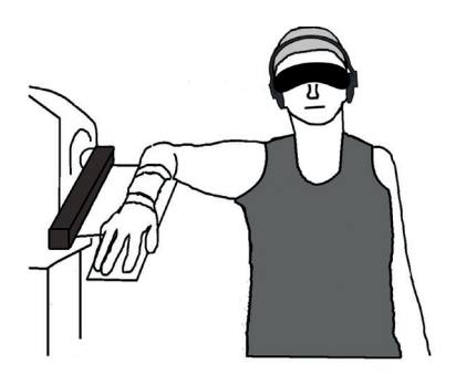
Fig. 2. Patient's position for assessment of joint position sense and kinesthetic sense.

A continuous passive motion (CPM) apparatus was used to evaluate shoulder proprioception for both joint position sense (JPS) and kinesthetic sense (Fig. 2). The shoulder was initially positioned at 90° of abduction, and the elbow was positioned at 90° of flexion. The reference angle in the JPS test was set as 50% of the maximum ROM. Before the JPS test, the participants were given 3 exercises to reproduce the reference angle and become familiar with the testing procedure. Then, the CPM rotated the shoulder at a rate of 1°/s into the internal rotation position from the start position to the joint position previously experienced. When the patient perceived that his/her shoulder had reached the reference position, the actual angle was measured. The error between the reference angle and the actual angle was calculated. The test procedure was repeated 3 times. The kinesthetic sense was detected by measuring the threshold to detection of passive motion (TTDPM). The CPM rotated