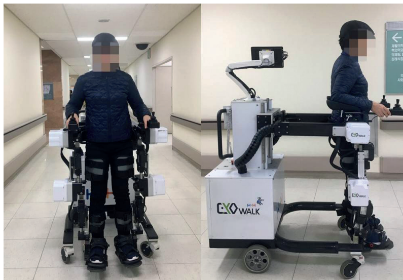
Fig. 1. Front and side view of electromechanically assisted gait trainer of Exowalk® (HR-02, HMM Co. Ltd, Republic of Korea).

1). A previous study of this device showed that the use of electromechanically assisted gait training for 30 min per day for 5 days a week for a period of 4 weeks was as effective as gait training with a physical therapist. In addition, questionnaires regarding patient satisfaction with the electromechanically assisted gait training revealed that the patients had confidence in their gait and a desire to continue gait training (8). The optimal training intensity is based on the number of repetitions of walking movements and high-intensity gait training that benefits the chronic stroke patients (9). Therefore, the current study planned to provide gait training of higher intensity than in the previous study in patients with chronic stroke.