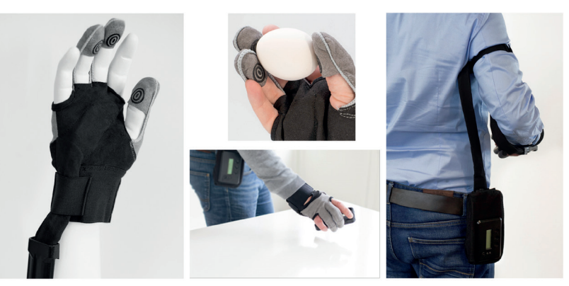
Fig. 1. Motor performance with the SEM Glove. The SEM Glove provides actuation for the thumb, middle and ring fingers. The applied force is measured by pressure sensitive sensors at the tip of the fingers of the glove and is regulated by the pull of thin lines that run through a cord and attach to the motors. A case that can be worn at the waist or in a bag includes the motors, computer, batteries and controller.

evidence regarding potential effects is still limited (10). Most robotic systems are relatively heavy and stiff, but current developers have produced more lightweight and flexible solutions (11–13). One is a new glove, based on Robotic SEM<sup>™</sup> Technology (14) (Fig. 1), which offers the possibility of increasing grip strength for patients with impaired hand function. The SEM<sup>™</sup> Glove device is designed to be slim, lightweight, neat, comfortable, and is intended to be worn as a glove. The technology concept goes beyond other state-of-the-art devices by introducing an "intention detection" logic that activates support if, and only if, the wearer initiates movement with a natural movement intention. This is achieved by sensors on the fingertips that detect minimal pressure changes initiated by the wearer, which are transferred to actuators. These respond immediately in order to facilitate the intended movement.