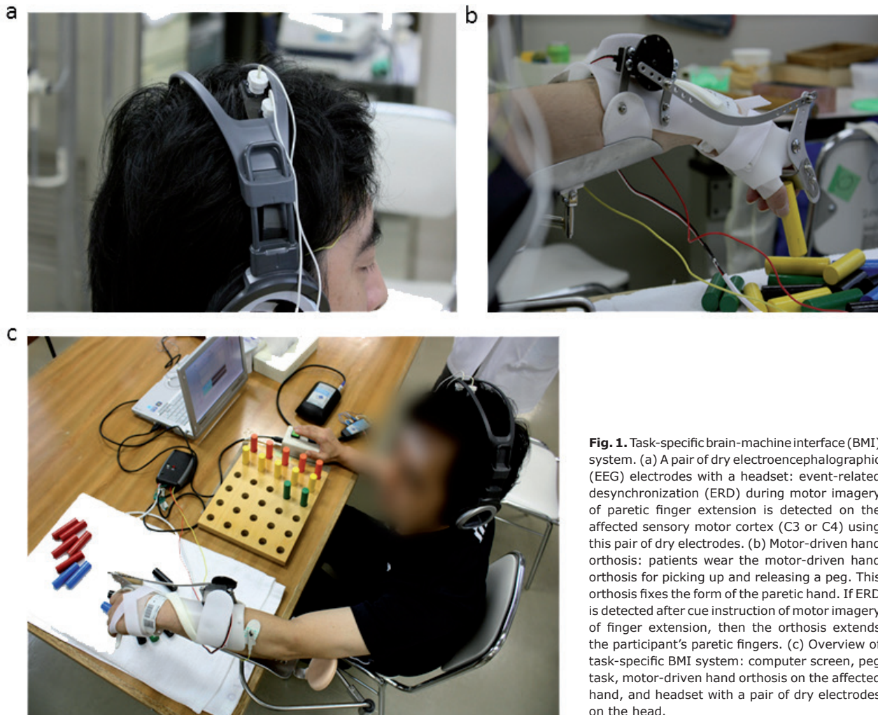
Fig. 1. Task-specific brain-machine interface (BMI) system. (a) A pair of dry electroencephalographic (EEG) electrodes with a headset: event-related desynchronization (ERD) during motor imagery of paretic finger extension is detected on the affected sensory motor cortex (C3 or C4) using this pair of dry electrodes. (b) Motor-driven hand orthosis: patients wear the motor-driven hand orthosis for picking up and releasing a peg. This orthosis fixes the form of the paretic hand. If ERD is detected after cue instruction of motor imagery of finger extension, then the orthosis extends the participant's paretic fingers. (c) Overview of task-specific BMI system: computer screen, peg task, motor-driven hand orthosis on the affected hand, and headset with a pair of dry electrodes on the head.