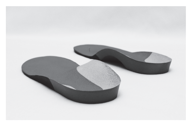
Fig. 2. Insoles with a 5° lateral wedge and longitudinal arch support.

Balance control. The Biodex Stability System is used to assess balance control by measuring changes in body weight distribution while