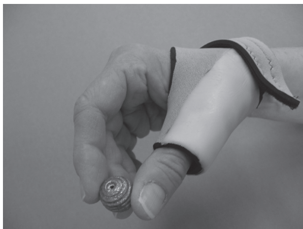
Fig. 2. A thermoplastic piece on the radial side of the splint provides additional opposition support, enabling a better pinch grip.

Manual dexterity of the dominant hand was assessed with the Sollerman hand function test (SHT). The SHT test assesses unilateral and bilateral handgrip function and reflects the most common handgrips