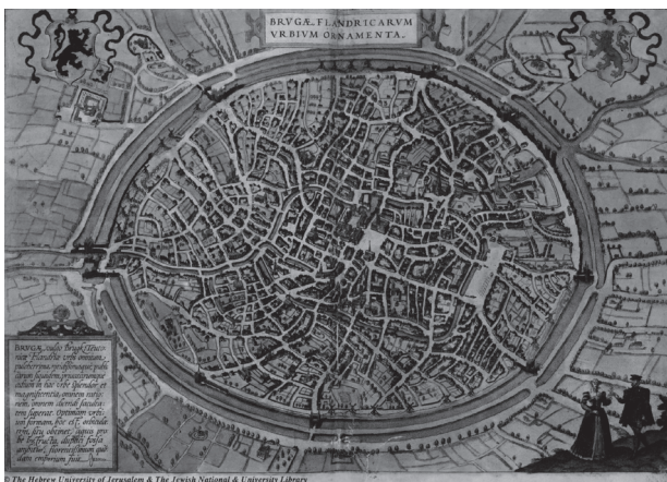
Fig. 2. The street system of historical Bruges as a symbol for order in the complexity of Physical and Rehabilitation Medicine.

The complexity of PRM represented in the comprehensive topic list can be symbolized by the complex transport system of historical Bruges (Fig. 2). Although complex, it corresponded to a culture of trade and human interaction very much in line with the art of rehabilitation medicine,