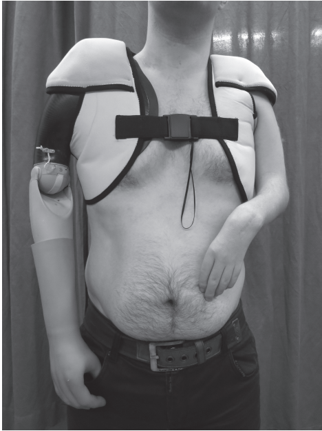
Fig. 3. Patient after final fitting.

recall) and the short-form World Health Organization Quality of Life (WHOQOL-BREF) questionnaire (English Version). While the SF-36 contains 36 items that are scored in 1 of 8 domains, the WHOQOL-BREF contains 26 items with 4 domains; namely: physical health, psychological, social relationships and environment.