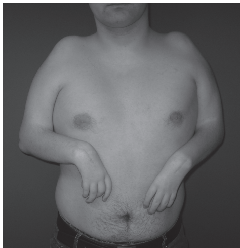
Fig. 1. Patient before amputation.