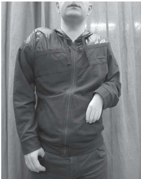
Fig. 4. Patient after final fitting with improved body image.

resulted in relevant improvements of hand and arm function as well as quality of life. Even though only 2 myosignals were available to control a 3-degree of freedom myoelectric arm, an appropriate algorithm was installed to change between the different prosthetic joints.