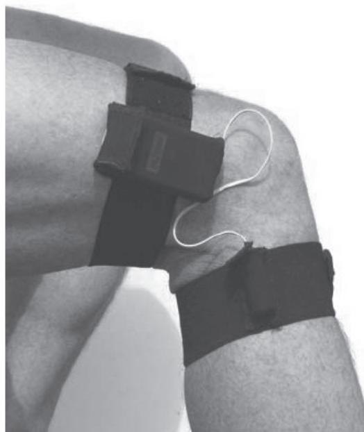
Fig. 1. Single-axis accelerometer, PAL2, attached to the right leg.

At the level of Activities and Participation (22), Barthel Index, ranging from 0 to 100 points was applied to assess activities of daily living (24), Berg Balance Scale (26), ranging from 0 to 56 points, was applied to assess balance, and mRS to assess disability at inclusion and during follow-up.