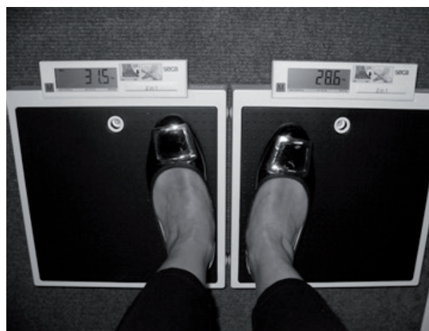
Fig. 1. Participant standing astride two identical scales in a natural standing posture.

Group B. (a) Group B measurements acquired at their baseline visit by DXA (GE Lunar Prodigy, Bedford, MA) from bilateral hip and total body scans were correlated with L/R WB measurements at baseline to assess whether any inequalities in L/R WB at this time point were associated with differences in L/R LLTM or BMD at the Total Hip or Neck of Femur (NOF). These regions were selected as they are most clinically relevant for the assessment of fracture risk. (b) L/R WB measurements were recorded in Group B by the dual-scales method at each of 3 visits at baseline, 6 months and 12 months.