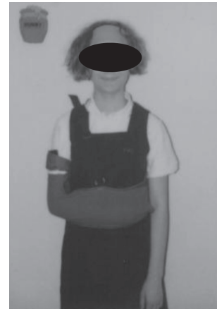
Fig. 1. Participant wearing a sling.

Balance (quiet standing) and posture were assessed before and after FUT. All participants stood quietly on a force plate (Advanced Mechanical Tech Inc., Watertown, MA, USA) cadenced at 120 Hz, with their arms relaxed at their sides. The participants were asked to stand as immobile as possible for 30 s, while looking at a target. This test was performed twice under two conditions: with and without the sling. Individual tracings of foot placement were used to ensure that identical foot position was used for each condition and for pre- and post-FUT test. Reflective markers were placed at the head of the second metatarsus, at the lateral malleolus and at the heel of the participant's foot to define the base of support (13). An 8-camera motion analysis system (VICON 512, Oxford Metrics, Oxford, UK) with a 60 Hz sampling rate was used to record the marker positions. The centre of the base of support was defined as the barycentre of the polygon defined by the reflective markers (13). Mediolateral (ML) postural asymmetry was as-