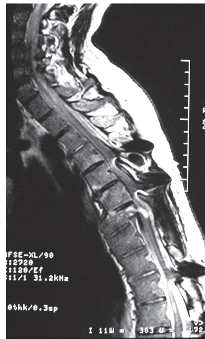
Fig. 3. Sagittal T2 magnetic resonance imaging of dorso-lumbar spine at one year post-trauma.