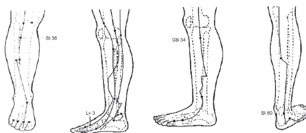
Fig. 2. Acupuncture points used in this study in the lower extremities.

All measurements were carried out by one of our team, who was blinded to the subject allocation. They were recorded before treatment,