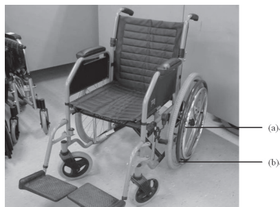
Fig. 1. Two-hand-rim propelled wheelchair (TPW). (a) Hand-rim for left-hand wheel propulsion and (b) Hand-rim for right-hand wheel propulsion propelled by the left arm.

Field test. The weight of the 3 wheelchairs was normalized, and all tyres were changed to 24 and 3/8-inch pneumatic tires with 40 psi of pressure. The field test included 2 phases. In phase 1 the patients propelled themselves forwards anticlockwise along an oval pathway 1 metre wide and 30 m from start to finish. The first lap was completed