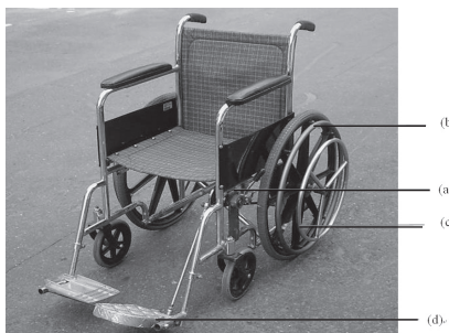
Fig. 2. Ankle-propelled wheelchair (AKW). (a) Four-bar linkage system for power transmission, (b) hand-rim for left-hand wheel propulsion, (c) hand-rim for right-hand wheel propulsion propelled by the left arm, and (d) pedal for right-hand wheel propulsion stepped on by the unaffected foot.