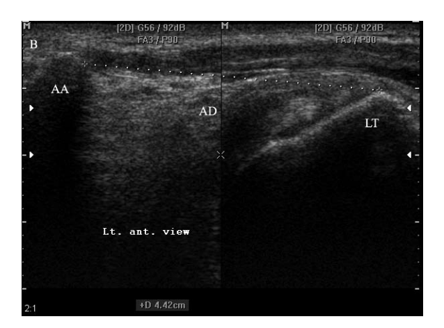
Fig. 3. Measurement of anterior distance (AD) from ultrasonography. The AD from the anterior border of the acromion (AA) to the apex of the lesser tuberosity (LT) was measured. AD was 44.2 mm for the affected shoulder. Split-screen imaging was used to measure the affected shoulder subluxation.

Statistical analyses were performed by SPSS/PC windows version 12.0 (SPSS Inc., Chicago, IL, USA) with the level of significance set at less than 0.05. Data are presented as mean with SD. The paired t -test was used to test for significant differences of radiographic and ultrasonographic distances between the affected and unaffected shoulders. The intraclass correlation coefficient (ICC) was used to examine intra-rater reliability of repeated ultrasonographic distance measurements. Spearman's rank correlation coefficients were calculated to test relationships between the shoulder subluxation ratios and the clinical evaluation scores