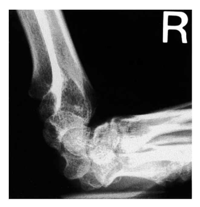
Fig. 1. A 49-year-old patient with C6 level revealed osteoarthritis on X-ray photograph in bilateral wrist joints.

Wrist joint pain was present in 11 of 42 complete tetraplegic patients. As to neurological levels, 9 patients were C6, 1 was C7 and 1 was C8. Those patients were given electrophysiological and radiological examinations (Table I). Physical examinations detected no palpable masses or ganglions at the wrist joint. No snapping or clicking was elicited. There was no special relationship between severity of spasticity and presence of wrist joint pain. Median sensory nerve conduction velocity and median motor nerve distal latency were delayed in 2 (motor