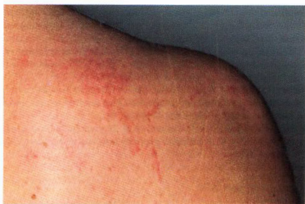
Fig. 1. A nummular and some linear pruritic urticarial plaques on the right shoulder.

The pruritic papules that at first had been present in our patient therefore may be diagnosed as the prurigo form of FM. However, the histopathologically identical but clinically different pruritic urticaria-like erythematous plaques that occurred later on in our patient were strikingly different from both the prurigo form of FM and the classic infiltrated plaque form. They were similar to the lesions first described by Enjolras et al. (1) as urticaria-like FM. Urticaria-like FM has been described in middle-aged men, especially in seborrhoeic