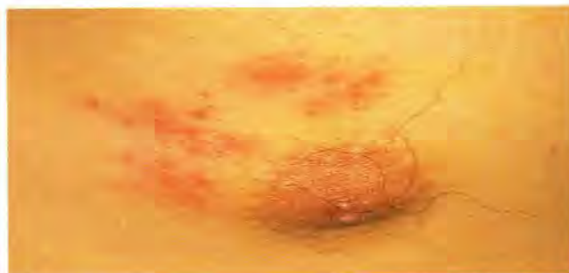
Fig. 1. Clinical features of the papular type of herpes zoster.

A Multitest ® CMI kit (Merieux Institute, Miami, Florida), consisting of seven recall antigens, was used as means of assessing CMI (Table I). Application was made on the volar surface of one forearm and test sites were evaluated 48 h after administration. A reaction was considered positive when the average diameter of an induration in two measurements appeared 2 mm or greater at any of the seven test sites. Measurements of the width and length of the induration were made