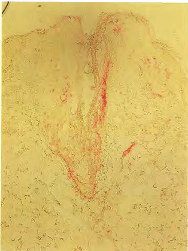
Fig. 4. In situ hybridization with VZV DNA probe in the papular type of herpes zoster. VZV DNA is found in the infundibulum of the hair follicle without spongiosis ( \times 100 ).

Follicular epithelial cells also had VZV DNA in all 4 cases of the vesicular type in which a hair follicle was found in the section. VZV DNA was also found in cells in the dermis beneath the epidermal vesicle in 5 cases. In the papular type, VZV DNA was detected in follicular epithelium or pilosebaceous unit in 7 cases. It was, however, not detected in epidermal cells not associated with hair follicles (Fig. 4). VZV DNA was not detected in the one case of the papular type in which a pilosebaceous unit was not found. In one case of the papular type, it was found in the perifollicular area of the dermis. In