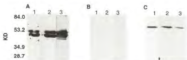
Fig. 2. Western immunoblot analysis of the specificity of mAb 111-15504. CNBr extracts of two representative isolates expressing class I M proteins and one representative isolate expressing class II M proteins were separated in 10% SDS polyacrylamide gels under reducing conditions. The separated proteins were transferred to nitrocellulose, and parallel strips were probed with either a biotinylated chicken anti-type IIo antibody followed by streptavidin enzyme reporter system (lane 1); a mAb 10B6 followed by a goat anti-mouse second antibody reporter system (lane 2); or mAb 111-15504 followed by a goat anti-mouse second antibody reporter system (lane 3). Panel A contains extracts from an M1 serotype isolate which expresses an M1 ~50,000 class I M protein. Panel B contains extracts from an M49 serotype isolate which expresses an M49 ~48,000 class II M protein. Panel C contains extracts from an M non-typeable isolate, 64/14, that expresses an M ~55,000 class I M protein. For precise experimental details, see Methods.

recognized specifically an epitope present in class I M proteins (data not shown).