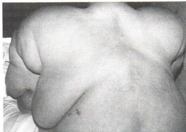
Fig. 2. Lipomatous deposits on the trunk.

On examination, the patient was found to be suffering from diabetes mellitus. Skin biopsy from one of the growths revealed a non-