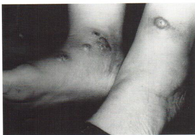
Fig. 3. Grouped sporotrichoid lesions of acute cutaneous leishmaniasis.