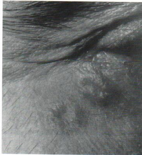
Fig. 1. Acute cutaneous leishmaniasis simulating basal cell carcinoma.

A 57-year-old man complained of two skin lesions located close to the outer canthus of the right eye, of 2 months' duration. Each was a 1-cm erythematous nodule with an atrophic center and pearly telangiectatic borders (Fig. 1).