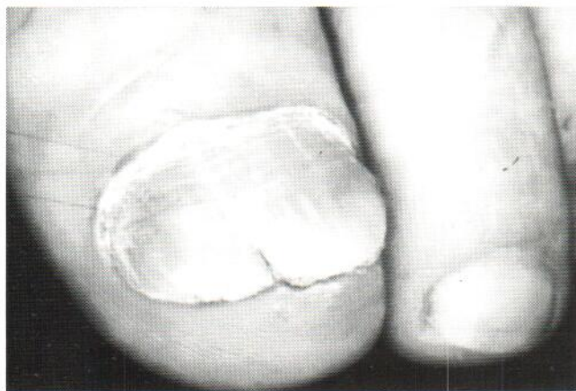
Fig. 1. Onycholysis, subungual hyperkeratosis and fissuring (case 2).

A raised ACE (case 1:62 U/l, case 2:88 U/l, case 3:98 U/l) and urine calcium (case 1: 340 mg/24 h, case 3: 244 mg/24 hs) were contributory. The tuberculin test was negative. X-ray films of hands and feet showed cystic radiolucencies and occasional scalloping and acroosteolysis of affected phalanges. Nail clippings for fungus were negative.