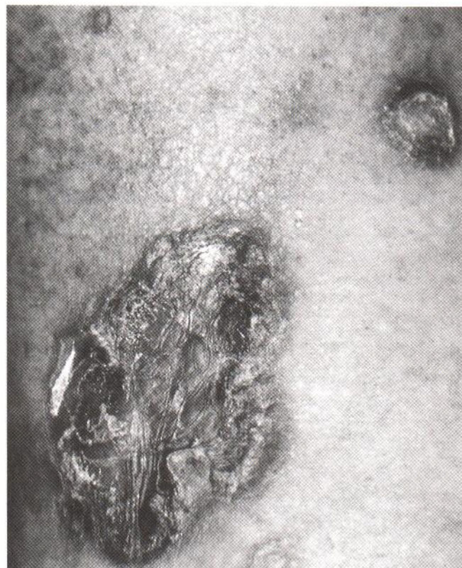
Fig. 1. Lesions of porokeratosis Mibelli on the leg, showing central areas of atrophy and hyperkeratotic borders.

On physical examination, numerous (>20) plaque-like, cornified lesions of 5 to 50 mm in diameter with an atrophic center and a keratotic ridge were present on both legs (Fig. 1). None of these lesions were located within the vitiligo lesions, which covered primarily the hands, face, neck and breast.