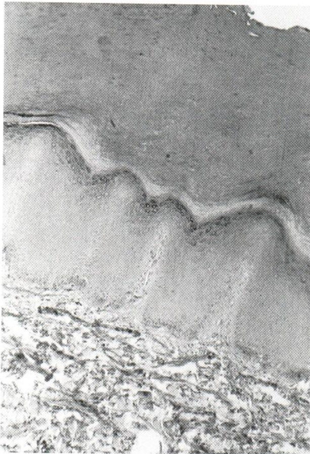
Fig. 2. Hyperkeratosis and acanthosis. Dermis is thickened by irregular bundles of collagen.

They both refused any method of surgical or chemical treatment.