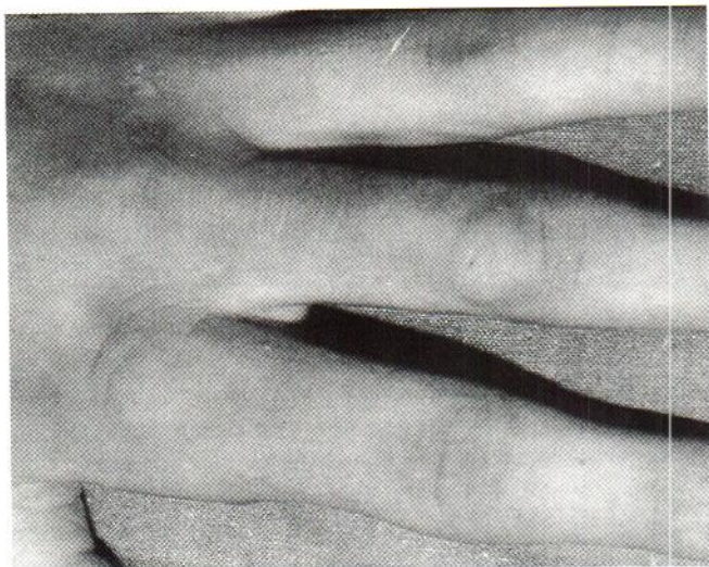
Fig. 3. Case 2. Left hand of the patient. Circumscribed fibromatous thickening over the dorsa of the proximal interphalangeal joint of the 3rd finger. Cutaneous thickness extended to the metacarpophalangeal areas and dorsum of the hand.