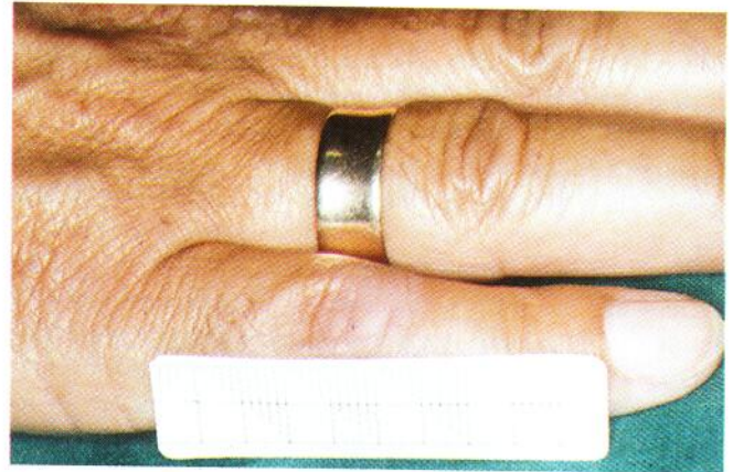
Fig. 1. (a) Sharply circumscribed, yellowish-grey hyperkeratotic lesion on the little finger. (b) Result after treatment with Nd:YAG laser hyperthermia – complete healing.

at a distance of 9 cm from the lesion with a spot size of 8 mm (defocused) and the lesion is divided into several parts if necessary. The energy power is 10 W and the irradiation period is a maximum of 20 s, repeatedly applied until a surface temperature of 40°C is reached, and this temperature is maintained for 30 s at least. No local anaesthesia is used because the procedure is easily tolerated. The patient only feels a slight burning sensation and is instructed to ask the surgeon to stop lasering when this burning becomes hard to bear. Furthermore previous experience proved that local anaesthesia had an unfavourable influence on the healing process. This was due to the lack of patient control of pain sensation, leading to a third degree burn. Surface skin temperature is controlled by thermocouple. After 6 weeks the patient is seen for reevaluation and the next session is performed (Table I).