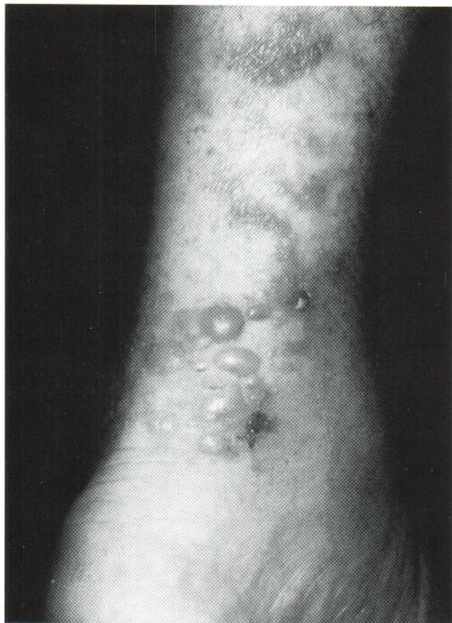
Fig. 2. Macules, papules, and bullae on the ventral aspect of the left leg.

suggestive of EM. This was confirmed by histology, showing changes characteristic of a dermal type of EM (5).