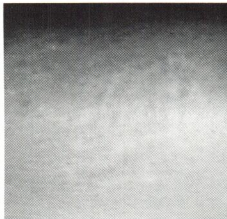
Fig. 2a–b. Vitiligo area before and after transplantation.

During the first few weeks the abraded areas was erythematous but pigmentation was seen when the skin was stretched. The colour became the same as that of the surrounding pigmented skin, except in one patient, who showed hyperpigmentation on her sun-exposed hands, where we had applied up to 3000 melanocytes/mm 2 . During an observation period of six weeks the pigmentation remained strictly located at the sites of transplantation and did not expand into untreated areas. No clear difference in pigmentation was seen between areas covered with Millipore net and those covered with the gel. The melanocyte-injected sites all showed pigmentation, but there were no signs of lateral spreading of the melanocytes.