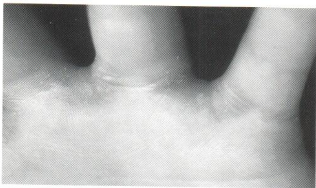
Fig. 1. Hyperkeratosis of the 2nd, 3rd and 4th interdigital spaces of the hands.

A 7-year-old girl was seen in June 1990 for a well-defined symmetrical hyperkeratosis of the 2nd, 3rd and 4th interdigital spaces of the hands (Fig. 1). The hyperkeratotic areas appeared clearly limited to the interdigital spaces with a prominent involvement of the palmar side.