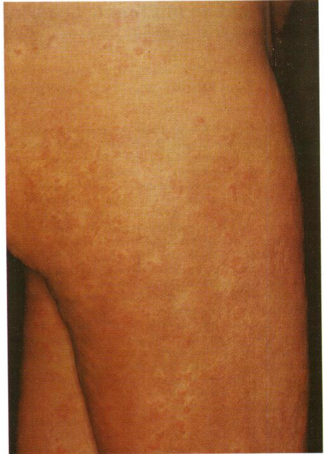
Fig. 2. Urticae on the buttock and thighs after oral nickel challenge.

To our knowledge, there is only one report in literature describing a connection between chronic urticaria and oral nickel intake. Espana and co-workers reported recently the case of a 48-year-old atopic, nickel-allergic woman who developed chronic urticaria that eventually disappeared after removal of two nickel-containing dental prostheses (7). Nickel that is either continuously released from prostheses or taken up in increased amounts through food has now to be added to the list of triggering factors for chronic urticaria. This possibility should be taken into account in patients with nickel-sensitization and chronic urticaria.