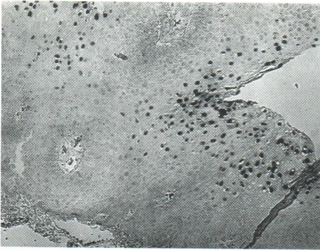
Fig. 1. Photomicrograph of penile condyloma acuminatum tissue. In situ DNA hybridization utilizing biotinylated HPV 6 probe (BIOHIT). HPV 6 appeared as punctate granules in infected cells.

(Fig. 2). Double infections of HPV were registered in 2 patients (HPV 18/31 and 16/31). All but one of the female consorts were identified as being infected with HPV, as detected by the HPV DNA screening test. DNA typing analyses (e.g. Fig. 3) revealed similar HPV types in the female partners as found in the male patients with condyloma acuminatum (Table I). HPV 6 and/or 11 were detected in 4 pairs, HPV 18 and 31 in one pair each, and HPV 18/31 and 16/31 double infections in one pair each.