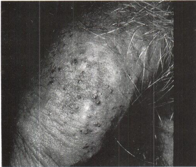
Fig. 1. A 19-year-old patient with Fabry's disease. Angiokeratomas on the shaft of penis, before copper vapour laser treatment.

the treatment of most angiokeratomas but are problematic due to bleeding during the treatment and are followed by small but notable scarring. Electrosurgery is also painful and therefore local anaesthesia is required, which is not easily achieved in the treatment of large areas (12). The use of CO 2 laser for successful destruction of angiokeratoma has been described by Kaplan & Giller (13). The argon laser with light in the blue-green spectrum of 488 and 514 nm has curative effects on angiokeratoma in Fordyce's disease as shown by Flores et al. (4), on angiokeratoma circumscriptum as shown by Pasyk et al. (8) and in multiple angiokeratoma as shown by Newton & McGibbon (7). Histologic studies have presented evidence supporting the idea that the light of the copper vapour laser of 578 nm, like the dye lasers, produces damages that are mainly concentrated to the ectatic vessels and less throughout the dermal layers (9). The vascular ectasia of angiokeratomas are within the papillary dermis and should therefore theoretically be well within reach of the effects of the copper vapour laser. In other reports beneficial effects of the copper vapour laser in vascular malformations have been suggested (10).