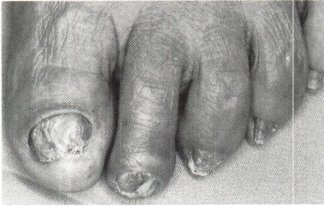
Fig. 3. The toe-nails 3 months later, following treatment. The tumours have diminished and the destruction of the nails has ceased.