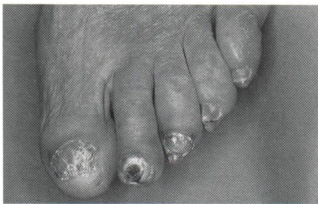
Fig. 1. Disintegrating toe-nails with slowly growing tumours in the nail beds on the left foot.

The patient was a 70-year-old previously healthy woman who, in 1982,