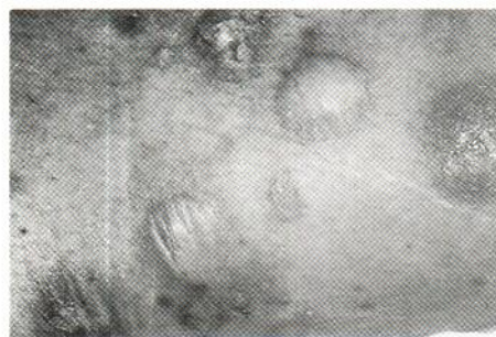
Fig. 1. Close-up view of bullae on the patient's left leg.

On admission he was febrile, temperature 38°C. He had regional adenitis. The skin lesions were generalized and involved approximately 10% of the total body surface. The lesions consisted of vesicles and bullae on an erythematous basis. The bullae had a diameter of 1-2 cm, and their contents were cloudy. No enanthema was seen. Some bullae had ruptured and left a red, tender surface (Fig. 1).