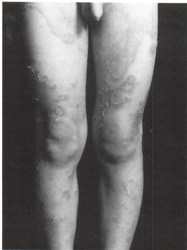
Fig. 1. Generalized pustular psoriasis characterized by collarette scales and macroscopic pustules at advancing edges covering the lower extremities noted in one of the twins at the age of 4 years.

On August 10, 1989, one of the twins underwent tentative tonsillectomy despite the lack of any signs of focal infection. During the first 2 months, he showed an exacerbation of skin lesions. Thereafter he