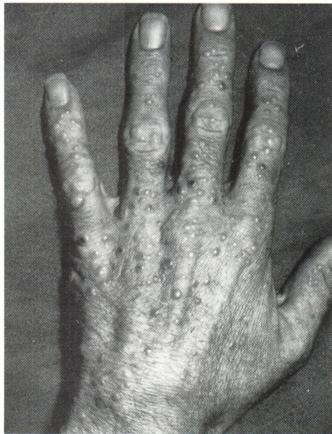
Fig. 1. Left hand: Numerous flesh-coloured, umbilicated papules.

After 9 days of fluconazole therapy, amphotericin B (0.3 mg/kg)