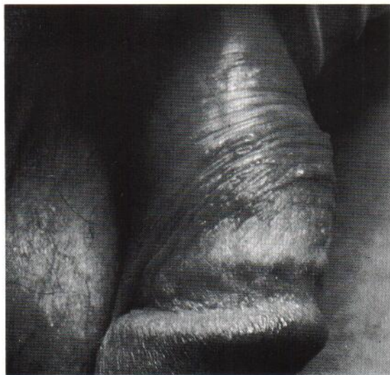
Fig. 1. Papular lesions on the mucosal aspect of the prepuce.