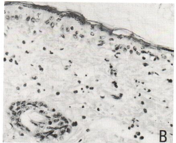
Fig. 1. Cutaneous response to injections of blister fluid from a patient with bullous pemphigoid. A markedly neutrophilic and eosinophilic infiltrate along with some mononuclear cells can be seen in the subcutaneous tissue (A), and in the upper and mid-dermis (B). (×200, H&E stain).