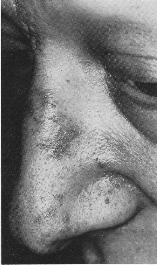
Fig. 4. Facial lesion showing LE + mucinosis.

acute pulmonary edema from which he died. No autopsy was performed.