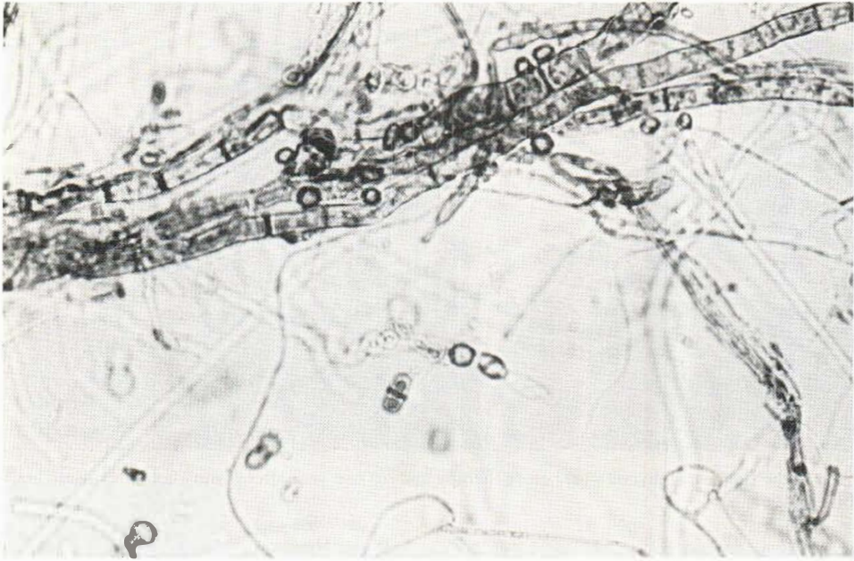
Fig. 3. Microscopy ( \times 375 ) of a one-week-old culture (Sabouraud's agar without cycloheximide) showing arthrospores and a mixture of colourless and dark-walled hyphae.