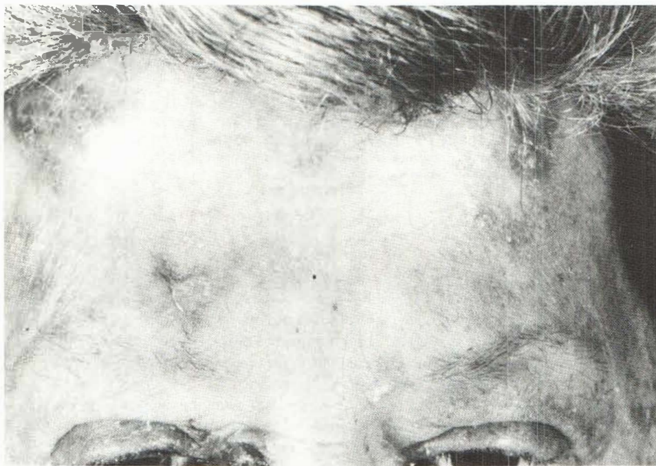
Fig. 1 (b). The same area after 2 months therapy.