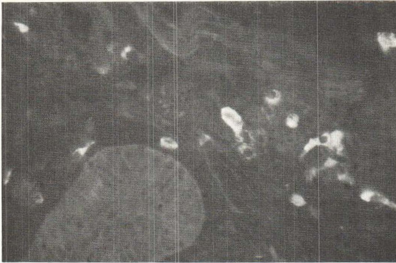
Fig. 1. Peritumoral mast cells in basal cell carcinoma (immunofluorescence): membrane IgE are homogeneously distributed.

1) the method of Yam (6) was used to reveal alpha-naphthyl acetate activity (alpha-NAE) which visualizes monocytes and macrophages;