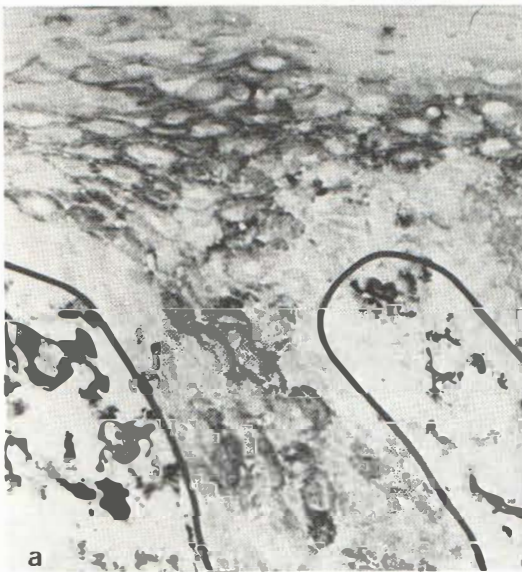
Fig. 2. Immunoperoxidase staining on serial frozen sections of a skin biopsy from a candida lesion. (a) Cells reacting with mouse monoclonal anti-HLA-DR antibodies (diluted 1/128) and (b) with anti-HLA-DQ (Leu 10) antibodies (diluted 1/128). The solid lines indicate the epidermal basal membrane zone.