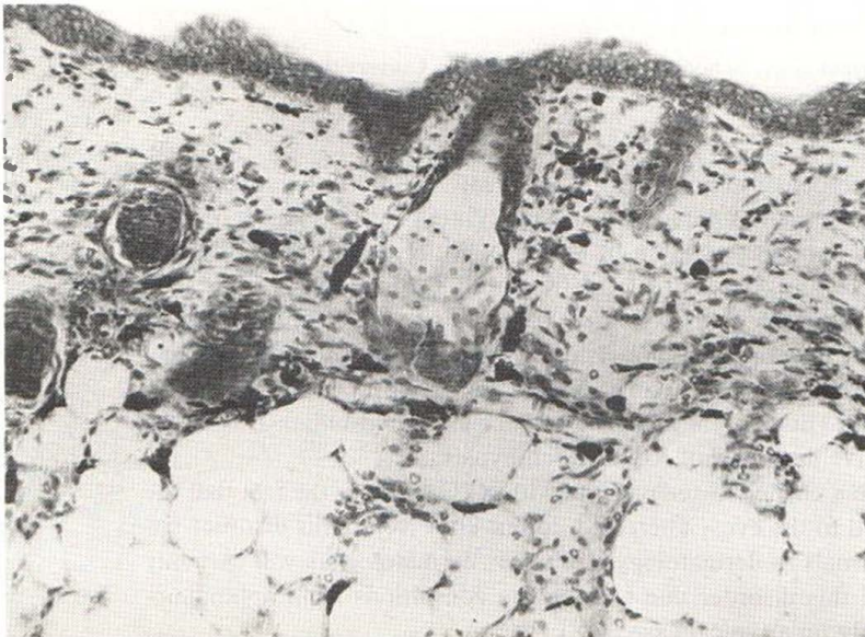
Fig. 3. Numerous mast cells are present in the dermis. Alopecia lesion on C57BL mouse. Toluidine blue staining, \times 150 .

The mast cell populations (mean value/mm 2 ) in the dermis of the bald and hairy areas are shown in Fig. 2. Mast cells in the bald area were considerably more numerous than in controls in C57BL mice (bald area: 81.1 \pm 22.3 , hairy area: 18.6 \pm 10.1 ) and in +/+ mice (bald area: 94.7 \pm 22.9 , hairy area: 26.0 \pm 11.5 ). Mast cell numbers were increased throughout the dermis of the lesions (Fig. 3) and were numerous around the hair follicles. Mast cells were not present in W/W v mice. The mean mast cell count was slightly higher in the lesions of human alopecia areata than in the controls, though the difference was not significant.