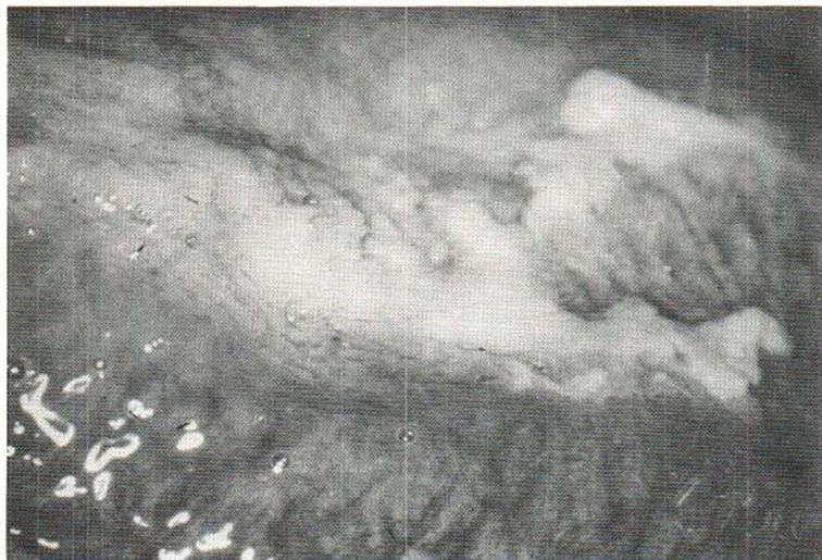
Fig. 1. White, irregular plaque on the right side of the tongue, before treatment with penicillin.