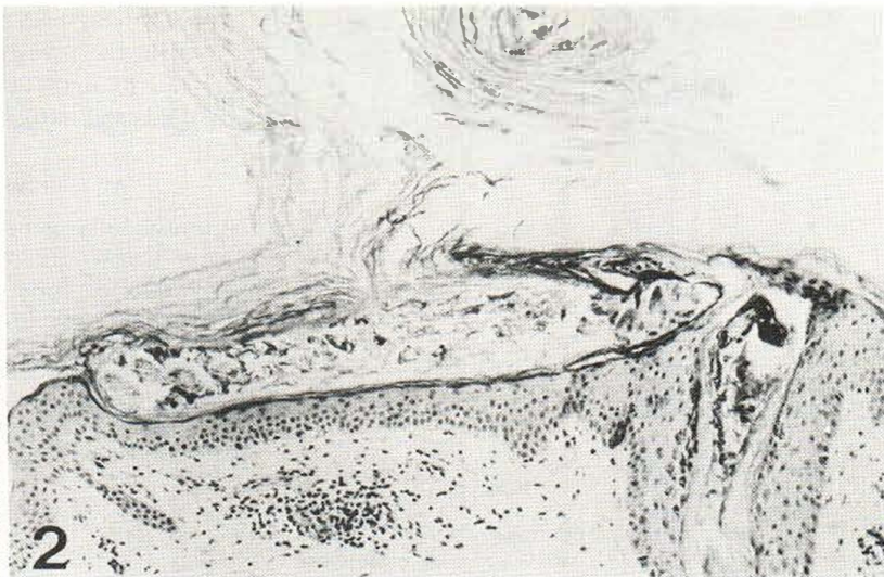
Fig. 2. Light microscopy of affected follicle. \times 380 .

therapy. Consequently, we looked for rolled hairs in 100 out-patients, but none could be found. The rolled hairs were characterized by light and scanning electron microscopy.