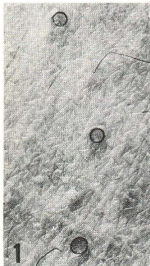
Fig. 1. Rolled hair.