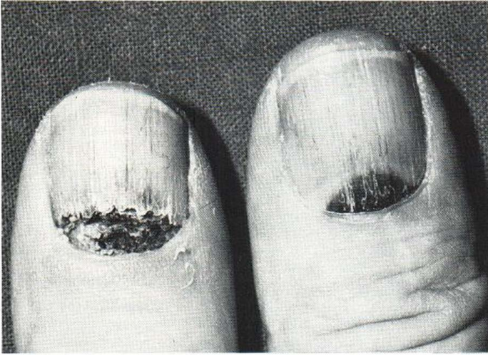
Fig. 1. Lesions of the left and right thumb.

Specific involvement of the nail bed or matrix in pemphigus vulgaris is not a well recognized feature of this disease. We report a patient with pemphigus vulgaris who presented with typical oral and cutaneous lesions. He developed spontaneous shedding of a thumb nail which extended progressively from the posterior nail fold (onychomadesis).