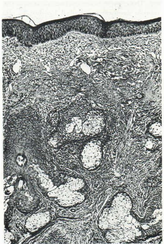
Fig. 2. Microscopic picture (HE, \times 40 ).

In agreement with the patient, Tigason was again ad-