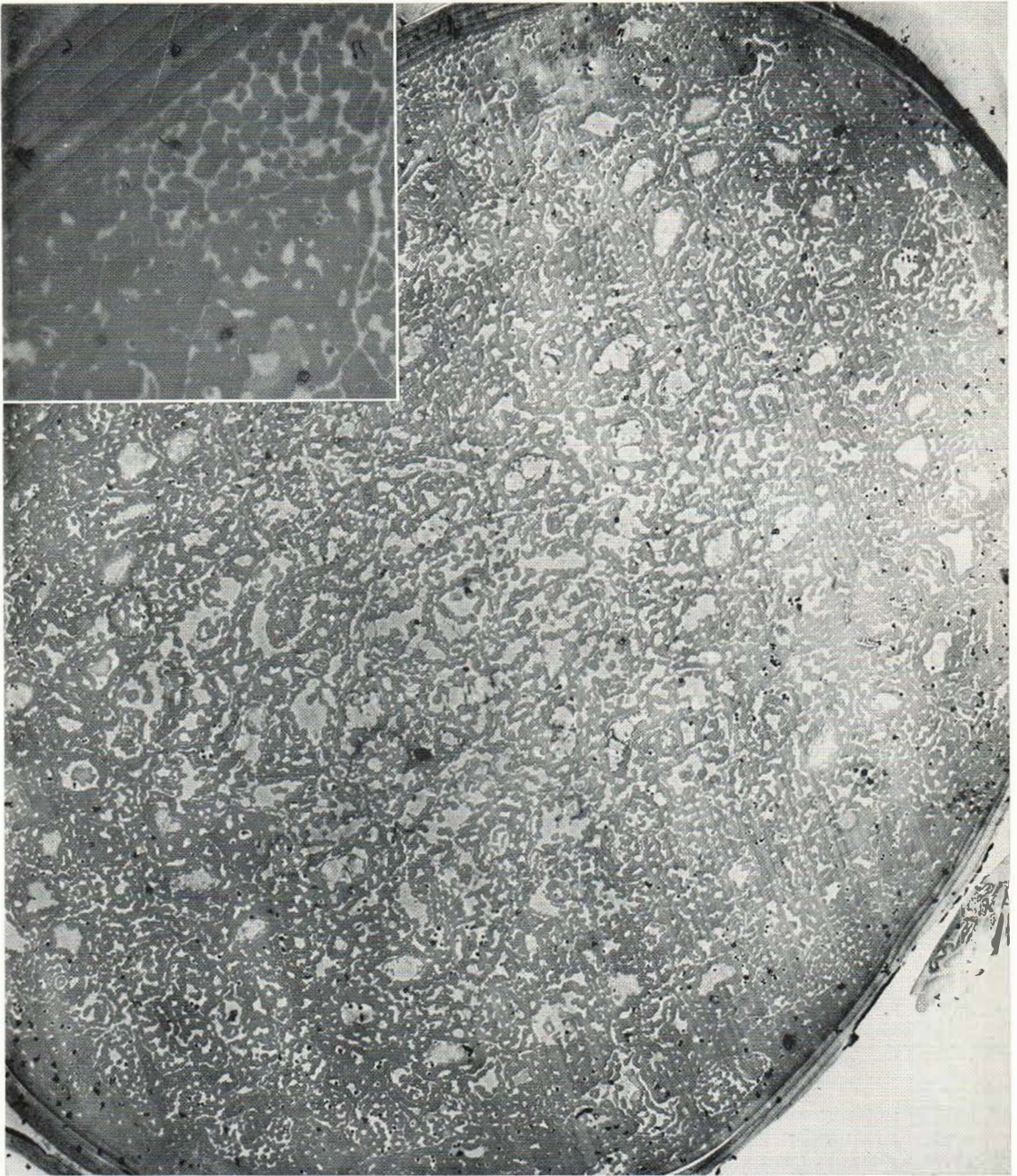
Fig. 2. Electron micrograph of a cross-sectioned hair fibre incubated with S^{35} -L-cystine for 40 min. Position of the incorporated tracer is indicated by the thread-like silver

grain filaments. Nuclear remains are seen in cortex cells packed with fibrous keratin. \times 1\ 900 . Inset, \times 5\ 800 .